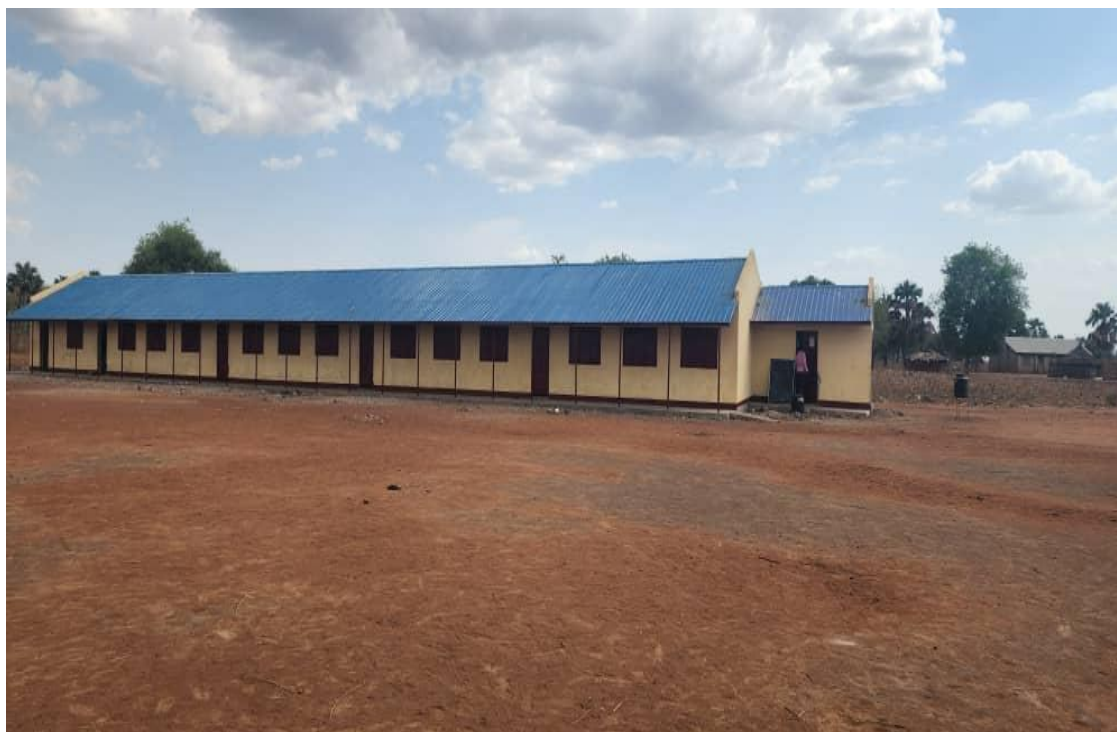
Machour Primary School in Yirol East County, new rehabilitated, on 8 April 2024

For the last four years, South Sudan has faced unprecedented flash floods affecting several infrastructures including schools and other educational facilities. Machour primary school in Machour Payam, Yirol East County is one of over 800 schools affected country wide. Five classrooms and one office block were severely destroyed by floods and strong storms. With roofs completely blown off, the school was forced to operate outside under tree shades. Shortage of instructional materials such blackboards, chalks, textbooks, charts and insufficient teachers, and classroom facilities, like furniture further made it a daunting task to facilitate learning. As a result, students lost interest to continue studies. Many students dropped out of school while a few others joined other schools.